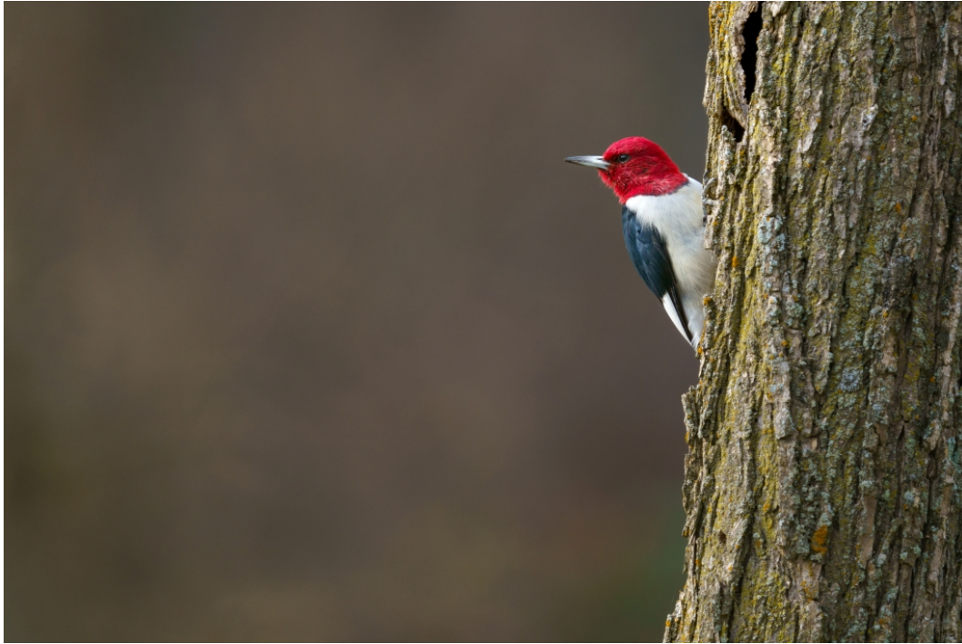
Woodland Negative Space