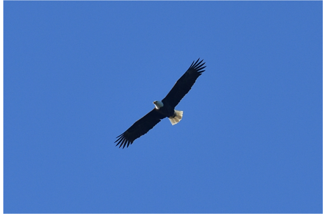
Soaring Sky High!